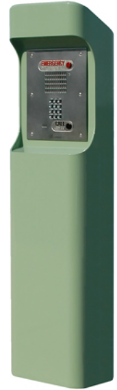
ETP-PM shown with ETP-400K